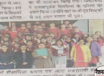
भदसाली स्कूल के बच्चों ने किया शैक्षणिक भ्रमण

हरदोली, 2 जनवरी (दुष्म) : हिमकेप्स शिक्षण संस्थान में भदसाली स्कूल से आए विद्यार्थियों ने शैक्षणिक भ्रमण किया। इस अवसर पर स्कूलों के शिक्षकों को और से जहाँ विद्यार्थियों के साथ कॉन्सल