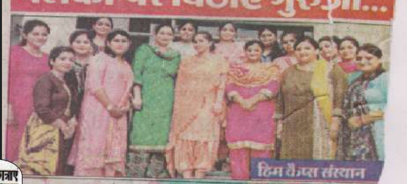
पलकों पर बिठाए गुरुजी...