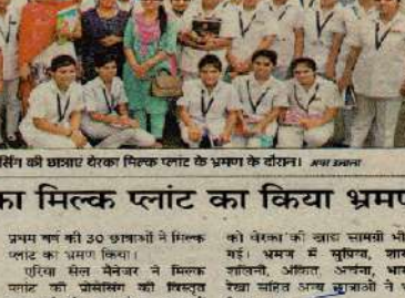
छात्राओं ने वेरका मिल्क प्लांट का किया भ्रमण

हरदोली (ऊना) : हिम केप्स कॉलेज ऑफ नर्सिंग की छात्राओं ने वेरका मिल्क प्लांट का भ्रमण किया। इस अवसर पर वेरका मिल्क प्लांट के प्रबंधकों को और से जहाँ विद्यार्थियों के साथ कॉन्सल