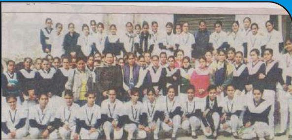
हिमकेप्स की छात्राएं शैक्षणिक भ्रमण के दौरान स्टाफ सदस्यों संग सामूहिक चित्र में

आगरा, (असहयोगी संस्करण) : जयमंडल स्टाडीस इन्स्टीट्यूट अकेड़ा हिमकेप्स कॉलेज में एंटी रेगिंग बारे जागरूक किया गया। कार्यक्रम पर एक लघु नाटिका आयोजित की गई, जिसमें छात्रों ने 'बूढ़ा' नाटक प्रस्तुत किया। कार्यक्रम के अंत में छात्रों को जागरूक किया गया कि एंटी रेगिंग केवल एक शब्द नहीं है, बल्कि यह एक व्यवहार है जो समाज को बाधता है। छात्रों को जागरूक किया गया कि एंटी रेगिंग केवल एक शब्द नहीं है, बल्कि यह एक व्यवहार है जो समाज को बाधता है।