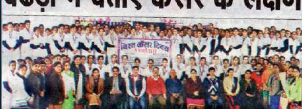
बटेड़ा में बताए कैंसर के लक्षण